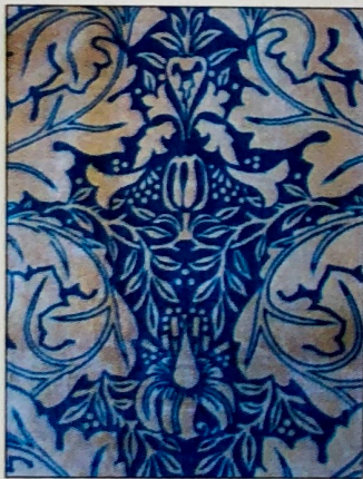
Detail of "Acanthus", a cotton Velveteen curtain by Morris & Co