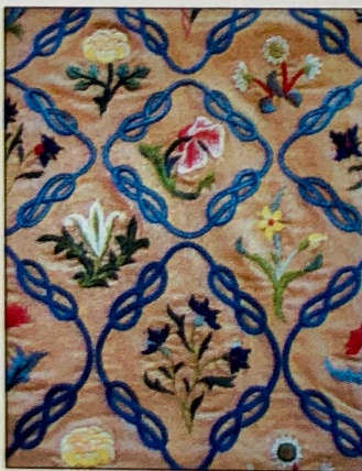
Bedcover embroidered By May Morris, c. 1919