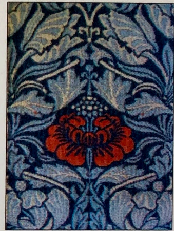
Detail of "Tulip and Rose" textile by William Morris