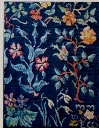
Detail of tapestry cushion cover made by May Morris c. 1896