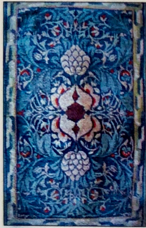
Morris-design rug, Hand knotted on canvas

The sale of these cards benefits the Emery Walker Trust a registered charity dedicated to the preservation of 7 Hammersmith Terrace and the collection of textiles, furniture, pictures and objects associated with Sir Emery Walker and the Arts & Crafts movement